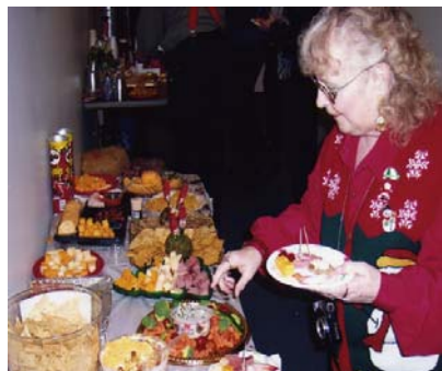
Windy Miller sampling delicious treats at the snack table